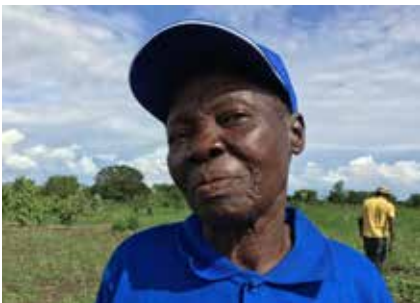
For many years Denmark has fought for women's rights and gender equality

Denmark played an active role in the preparatory work ahead of the adoption of Security Council Resolution 1325 and in 2005 became the first country in the world to develop a national action plan for the implementation of the resolution. This action plan was updated in 2008 and again in 2014. Denmark also held a seat on the Security Council in 2005/06,