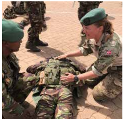
Instructors from the Danish National Home Guard teach first aid to Kenyan soldiers

Denmark will work to advance the WPS agenda as part of the UN's reform efforts, particularly through the Secretary-General's reform agendas in the peace and security area, Action for Peacekeeping (A4P) and the sustaining peace agendas. The planned Danish membership of the UN Peacebuilding Commission will enable substantial Danish involvement and a stronger Danish voice in the UN's work with women, peace and security. In intergovernmental negotiations, where implementation of the WPS agenda faces challenges, Denmark will also promote a strong and progressive approach.