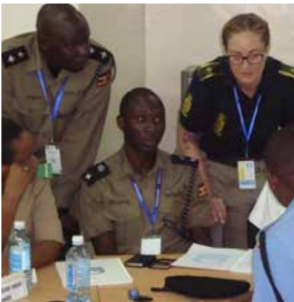
Danish police women and men do training in i.a. the Middle East and Africa

Denmark's strong security policy profile is largely built on our coordinated approach to strategic planning and activities on the ground. We know that there is a need for political solutions to prevent and resolve violent conflicts. This often requires that we utilise the full range of tools at our disposal.