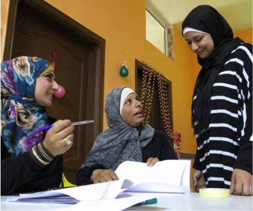
In many countries women are excluded from formal as well as informal decision making processes

Danish Ministry of Defence, the Danish Ministry of Justice (the Danish National Police). The working group will coordinate efforts to follow up on the implementation plans and the involvement of civil society. This will include an annual forum, where the strategic and overall goals of the plan will be discussed, as well as more specialised, thematic working groups. Efforts must also be made to ensure that WPS is an element of regular