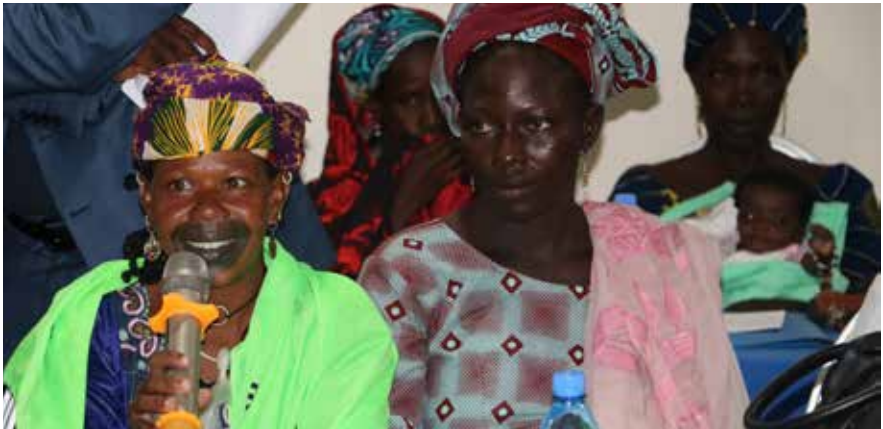
Women in Mali in a workshop on the regional security force, the G5 Sahel Joint Force