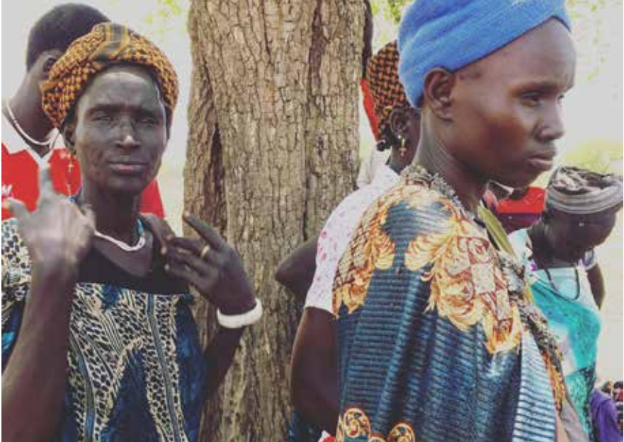
In humanitarian crises women and girls are far more exposed to sexual exploitation and abuse than men

Denmark will also strengthen its prevention and management of cases