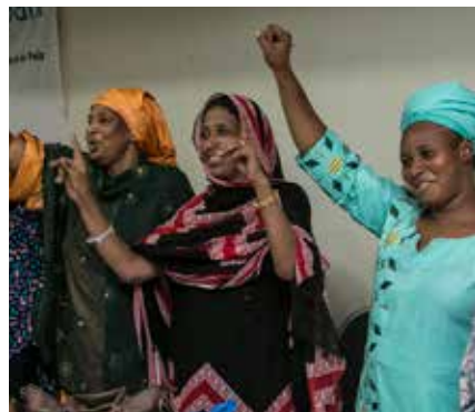
Women in Mali participate in a meeting on how to increase their participation in the peace process

stabilisation efforts in the world's conflict zones, where the focus is on conflict prevention, conflict resolution and peacebuilding. Denmark's peacebuilding and stabilisation efforts are primarily financed through the Peace and Stabilisation Fund, which must increasingly focus on strengthening the agenda for women, peace and security. Future evaluations and programmes of the Fund will therefore include an assessment of how current and future activities can increasingly incorporate gender perspectives and create results on the ground for women and girls. Where relevant, international and local implementation partners will be asked to provide specific input on how the WPS agenda can be strengthened through future activities. The goal of the Peace and Stabilisation Fund is to make an even bigger difference – also for women and girls.