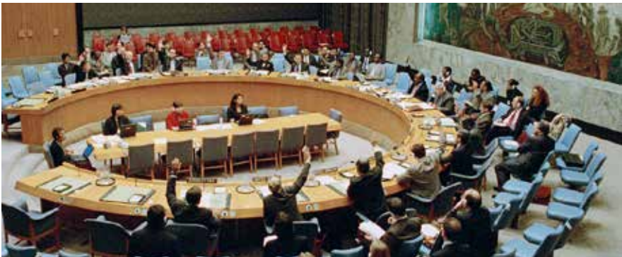
Resolution 1325 is adopted in the United Nations Security Council on October 31, 2000

Therefore, Denmark will increase its focus on recruitment, retention and career promotion of women, not least in management positions in the Danish Defence (including the Danish Home Guard and Danish Emergency Management Agency), the Danish National Police, and the Ministry of Foreign Affairs of Denmark. Today, more women than ever before see the Danish Defence as a career opportunity. Over the past 15 years, women have increasingly registered for conscription service and other Danish Defence training programmes. We must