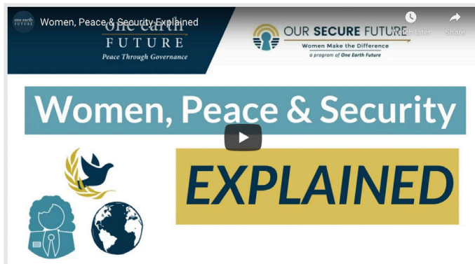
WPS Explainer Video