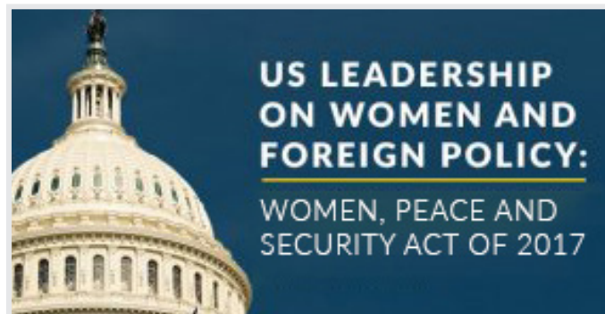
US Leadership on Women and Foreign Policy: Women, Peace and Security Act of 2017